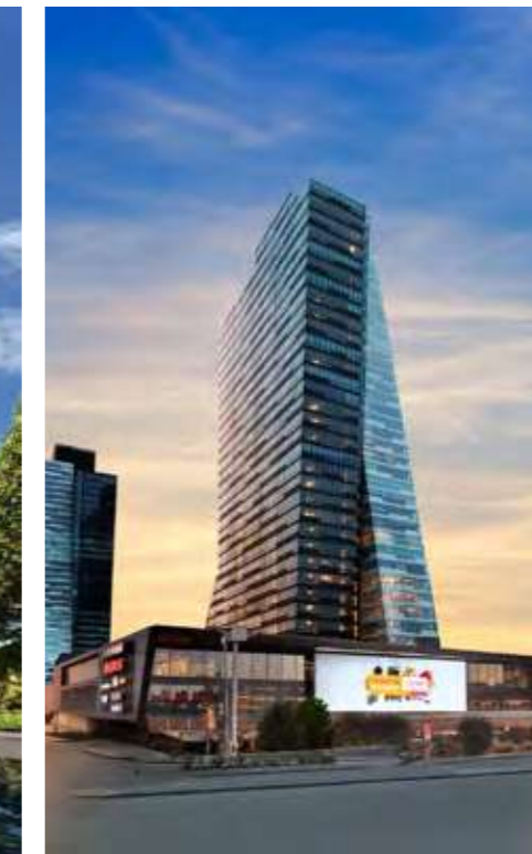
TRUMP TOWER ISTANBUL, TURKEY