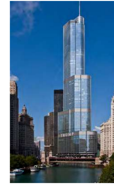
TRUMP INTERNATIONAL HOTEL & TOWER CHICAGO

Virtually no detail is overlooked. With each of its properties, Trump consistently continues to raise the bar for luxury living.