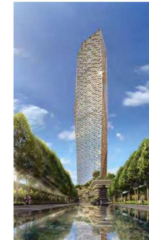
TRUMP TOWER MUMBAI, INDIA