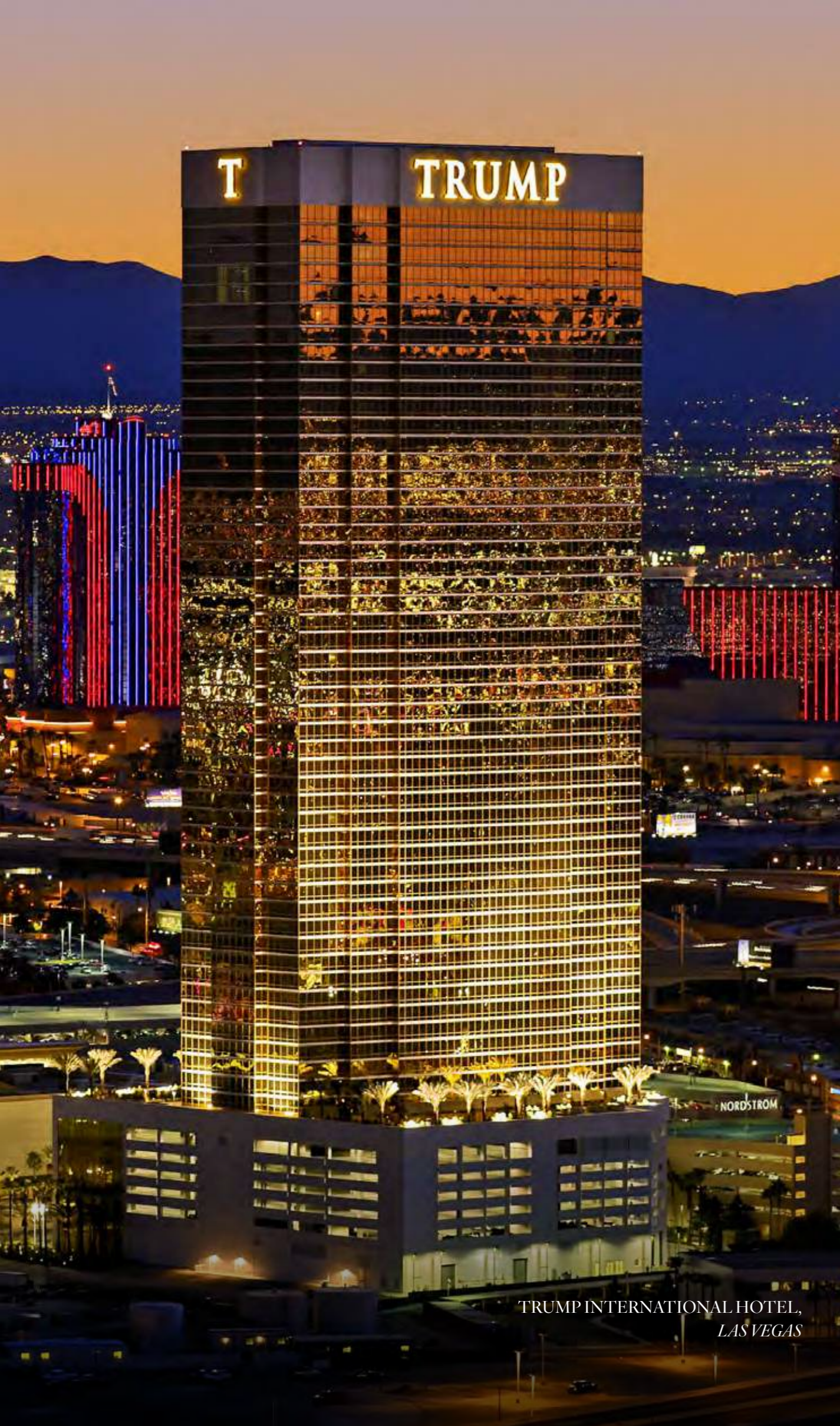
TRUMP INTERNATIONAL HOTEL, LAS VEGAS