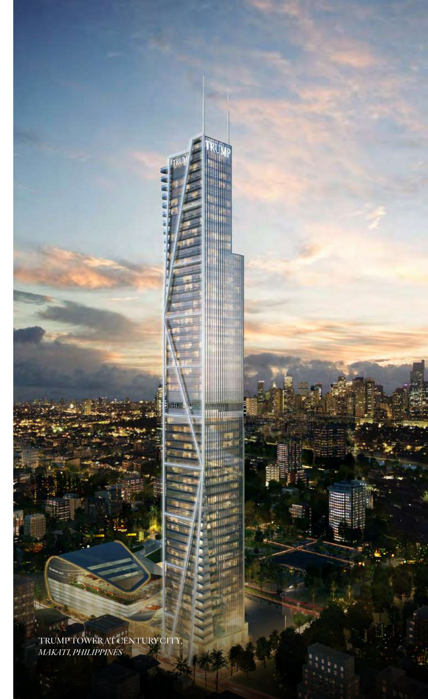
TRUMP TOWER AT CENTURY CITY, MAKATI, PHILIPPINES