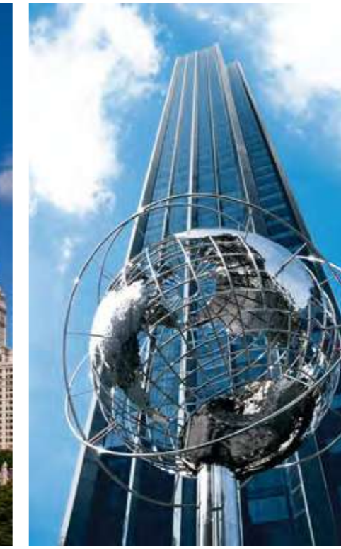
TRUMP INTERNATIONAL HOTEL & TOWER, NEW YORK